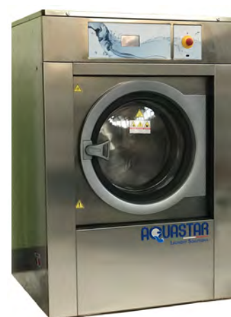
MAQ2 A 35 C, A 45 C