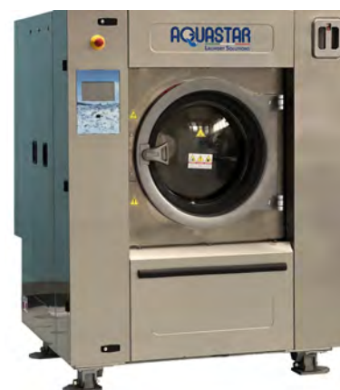
MAQ2 A 60 C, A 80 C, A 100 C, A 120 C